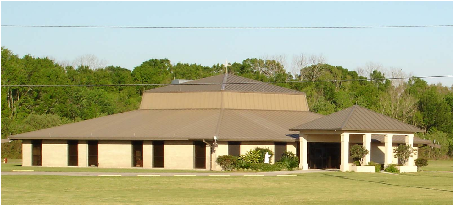
Chancery office, Diocese of Houma—Thibodaux, Louisiana

“If any one lie with a man as with a woman, both have committed an abomination, let them be put to death: their blood be upon them.” Leviticus 20:13